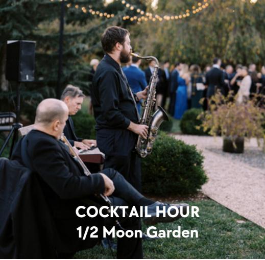
COCKTAIL HOUR 1/2 Moon Garden