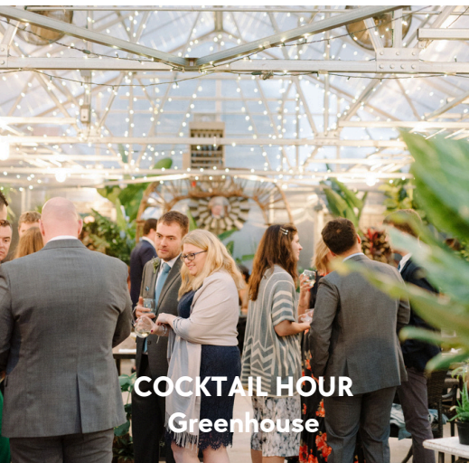
COCKTAIL HOUR Greenhouse