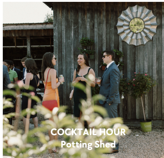
COCKTAIL HOUR Potting Shed