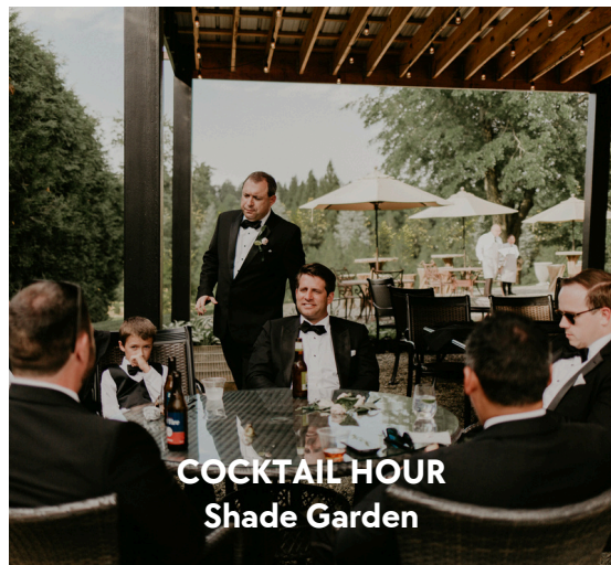
COCKTAIL HOUR Shade Garden