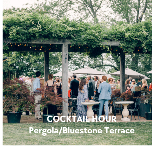
COCKTAIL HOUR Pergola/Bluestone Terrace